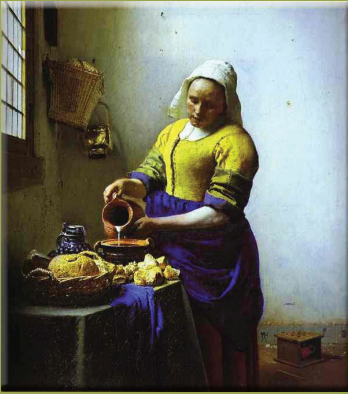
The Milkmaid by Johannes Vermeer