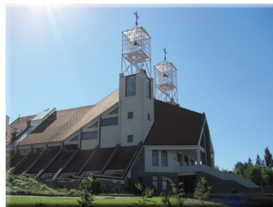
Modern church building