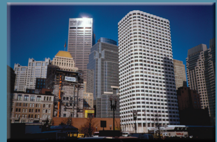
Downtown Boston cityscape