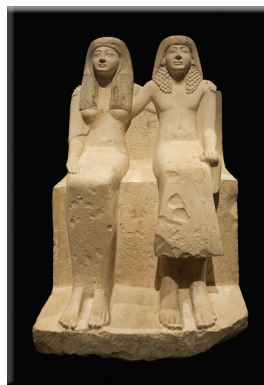
Egyptian couple, Emelt szintű p140