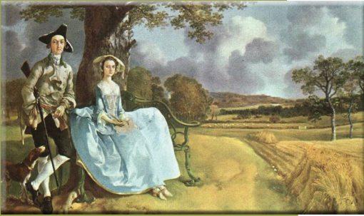
Gainsborough Mr and Mrs Andrews 70.5 x 119.5 cm, oil on canvas

Vermeer carefully organises the space around the maid. The composition is built up along two diagonal lines. They meet by the woman's right wrist. With this trick of composition, Vermeer focuses the viewer's attention on the act of pouring out the milk.