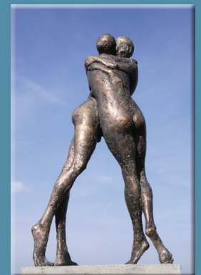
Couple, modern art, Emelt szintű p140